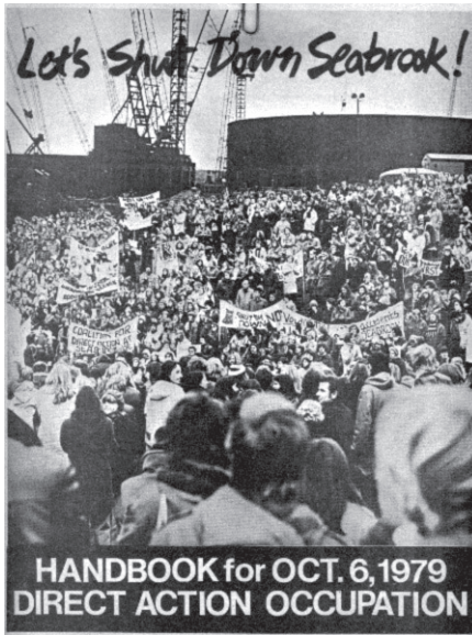
Handbook for collective action to take over the unfinished Nuclear power plant in Seabrook, New Hampshire 1979

individual mark with all that it represents, then considering what has been said about the excess and instability of group identity a collective signature would by definition be incomprehensible. Not unlike the grotesque truth of The Matrix , recognition of the collective condition demands its price, both individually and professionally.