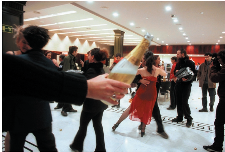
YOMANGO performance with stolen Champaign in Barcelona bank, 2002

boundaries both real and imaginary are historically determined and often harshly material. By contrast I understand conflict and difference, rather than “merging,” to be necessary for the formation of the collective. Furthermore such incipient abrasiveness must carry over to the routine functioning of the group possibly sparking, violent repercussions both inside the collective and between the collective and existing institutional forms. As anyone who has worked in this way will attest, the effort required to sustain collective work rises in direct proportion to the professional and emotional toll extracted on constituency. Yet it is exactly this state of over-determination --the heterogeneity of membership, the meetings where too much is attempted or rejected, too much brought to the table and left off the table, the fleeting ecstasy of collaborative expenditure and a space suddenly opened to the unpredictable effects of class, race, gender, sexual preference, age, divergences in ability, knowledge and career status --all of this can never be encompassed within the group identity per se; yet this excess is what makes the collective viable.