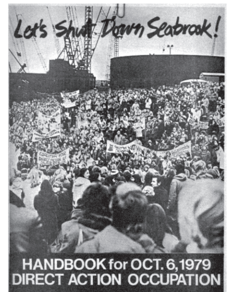
Second issue of Red-Herring 1978

Our most urgent task right now is to find a more representative method of arriving at true agreement within the group. Not to do this is to doom us to continual tactical maneuvering using these rules--tactics that , as was amply demonstrated last week, lead to destructive polarization and quite palpable disunity...In this group we are not looking