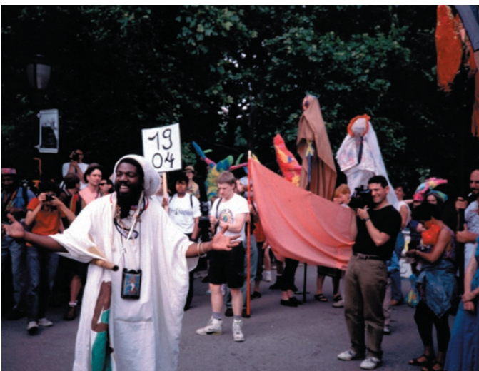
Public parade-performance by REPOhistory 1992, NYC

If utopian desire forms a residual political unconscious or figurative narration within mass culture then collectivity must be present as well. Perhaps the most transparent figure of collective practice is that found in certain science fiction narratives that depict a fantasy of organized resistance to collective occupation by hostile “others”: aliens, vampires, mutant humans, and even computers. It is a narrative that appears in films such as “They