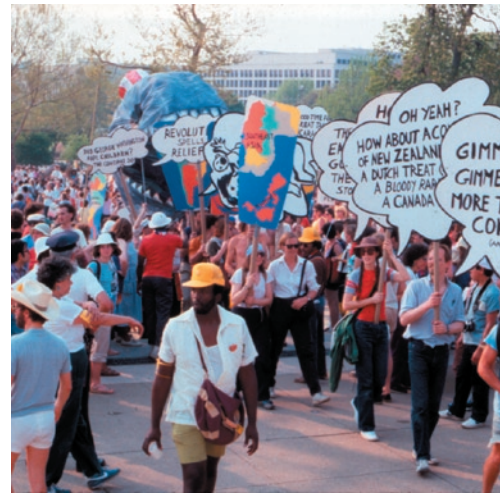
PAD/D or Political Art Documentation and Distribution circa 1983

Certainly the contingencies Derrida enumerates play themselves out within and around the art collective including the unwitting consolidation of prevailing power relations --masculinist authority, over-centralization, bureaucracy-- and perhaps even more insidiously what