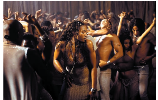
Resistance fighters dance literally underground in Zion from the Matrix Reloaded 2003

The issue of rupture within community based artistic collaborations is an important topic because rupture is an inherent part of the process of working with the community... Communities are not made up of people who are all the