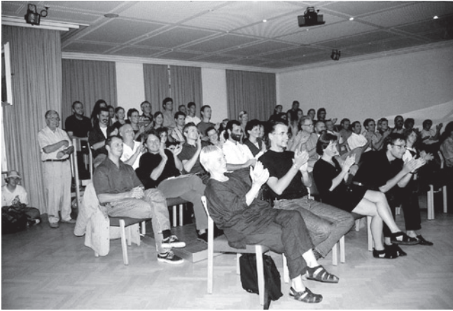
Wochenklausur community inter- vention Austria

stages.” Clever locates these web-based fraternities “even before members are aware of their community’s existence” by tracing the electronic links “spontaneously” generated between users. 1. Therefore if collective incorporation is so unrelenting that it can be revealed by a machine, one might question why non-individual cultural activity is treated as the exception? Conversely, how can the artist be defined as an autonomous producer detached from politics, history, and the market?