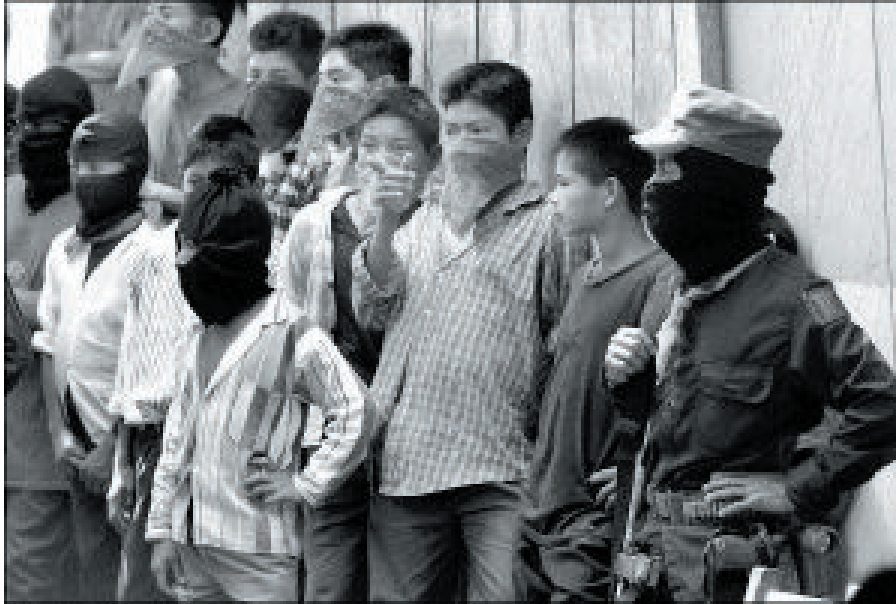
Zapatista guerillas meeting in Chiapas Mexico mid 1900s